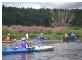
Summer on the Charles