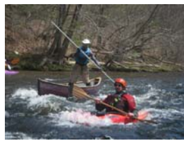
Spring on the Willimantic