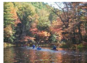
Fall on the Blackstone